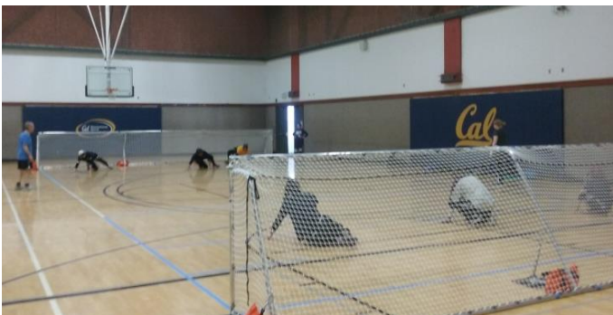
The Cal Goalball Team